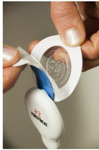
2. Remove the cover.