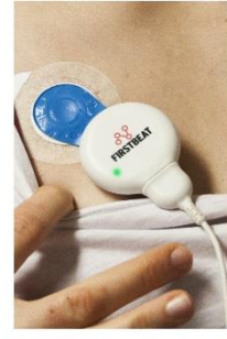
4. The measurement starts automatically when the device is attached. Make sure the green led is flashing. NOTE: The light is easiest to see in a dark room.

Detach the device during showers, sauna and swimming. It is not allowed to wear the device in the water! Recording continues automatically when you re-attach the device. When you want to end the measurement, simply detach the monitor from your body and remove the electrodes. The device will stop recording automatically.