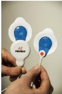
1. Attach the electrodes to the cable and device ends.